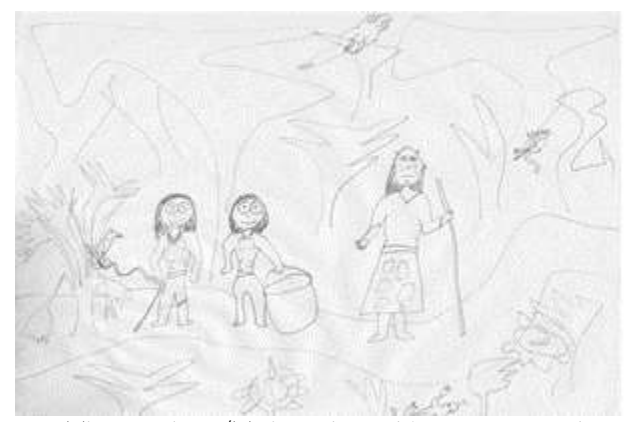
Figure 3. The Brothers/Twins adopted by jaguar grandmother

Later, the babies grow up and help the grandmother, who adopts them, with chores and hunting (Figure 3). They are named as Cuillur and Dociru, and they are "twins" but not identical. The Twins finally discover that the jaguars killed their mom and decide to kill the jaguars. They decide to kill the jaguar sons by making an elaborate bridge that is a trap. When the jaguars are in the middle of the bridge, the Twins untie it, and all the jaguars, except one female who escapes, fall and "die." As they fall, the Twins shout "stone, stone, stone, stone, stone. (Figures 4 and 5), a kind of shamanic discourse that cause the jaguars to turn into stones. From the escaped female, the jaguars survived and reproduced. It is said that on judgment day ( izhu punzha ) the jaguars will revive and devour humanity.