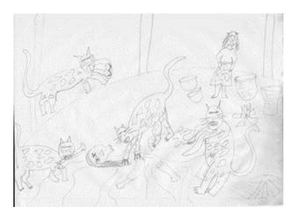
Figure 2. Mother becomes food.