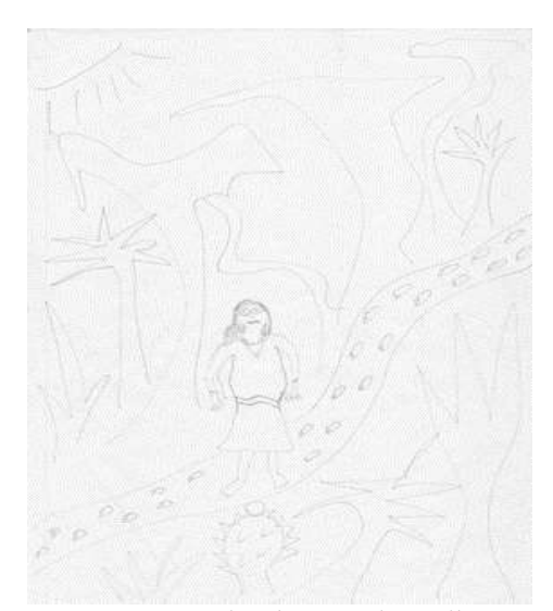
Figure 6. Mother lost on the trail.

Act I contains an early scene of the mother getting lost on the trail. These details of how mother gets lost are lacking in the Napo version yet developed in the Mbyá story. The scene involves the baby or babies in the woman's stomach guiding her on the trail. They/He keep(s) asking mother to grab a flower. When she gets stung by an insect (bee/wasp), she gets angry. Then the Twins/Pa'i become silent out of anger. The woman takes the wrong trail and ends up at the jaguar house (Figure 6).