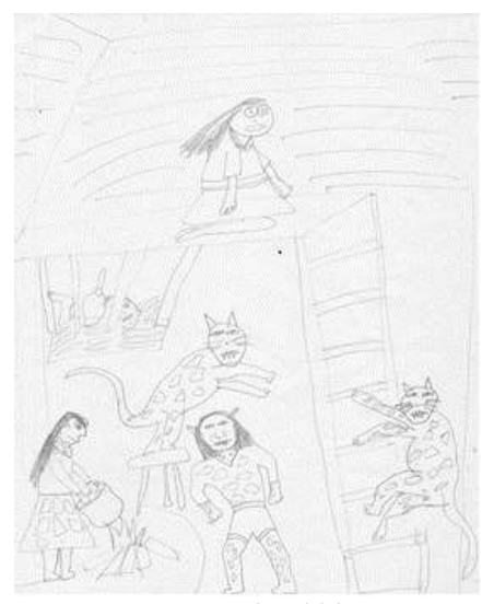
Figure 1. Mother hides.

In the Amazonian Kichwa mythology, we begin with a young woman who is impregnated by Moon Man, her brother. Once discovered, he ascends to heaven; she cannot follow and turns into a nocturnal bird (named "Iluku") who sings at the moon (common potoo ). The woman gets lost on the trail and ends up at jaguar house. In the Sarayaku version of the AK mythology, the woman gets lost on the trail because she scolds her children in her belly and they refuse to tell her the correct path, a detail I have not found in the Napo versions (see below). Once the woman ends up at the jaguar house, the jaguar grandmother tries to save her by hiding her in a basket or on a ledge that is high up in the roof (Figure 1).