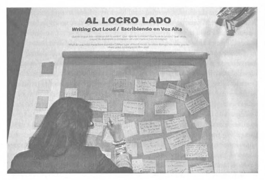
FIGURE 1 Writing out Loud/Escribiendo en Voz Alta.

I draw upon Mata Codesal's (2010, 24) NYC research study "where Ecuadorian migrants can easily get into an 'already-present home away from home' creating and sustaining a transnational food sphere". The author illustrates how migration is then also experienced through the body and how food can be used to fight off the sense of fragmentation or discontinuity brought into people's lives by migration. Other authors such as Fischler (1988) discuss the relationship between identity formation and food too, highlighting the centrality of food to our sense of identity, as it asserts diversity, hierarchy and organisation.